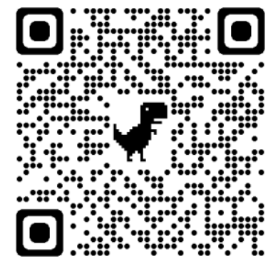
QR Code for the website of the Military Officers Club of Northeastern Wisconsin.

All newsletters will be available from a pull-down menu. It was suggested that they have an associated print button for those who want a hard copy. This will be added.